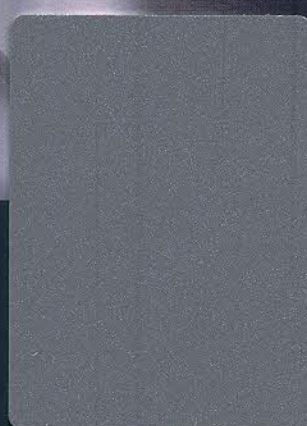
+/- RAL 9007 SD701C7900720